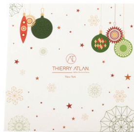
49pc Assorted Holiday Box