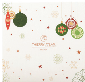
25pc Dark Holiday Box