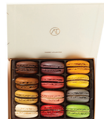
12pc Thierry's Favorite Holiday Box