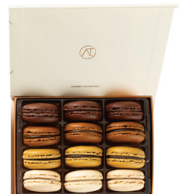
12pc Classic Holiday Box