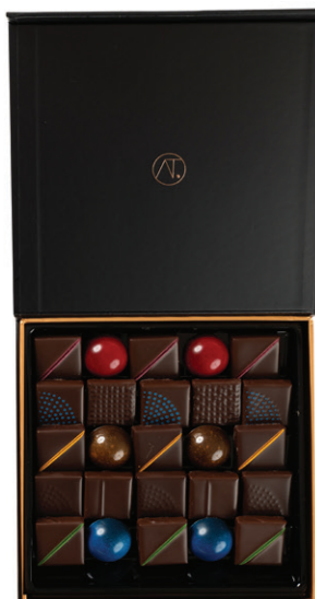
25pc Milk Holiday Box