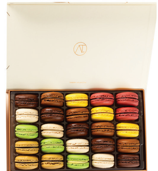
25pc Taste of Paris Holiday Box