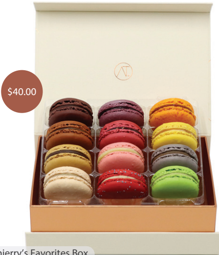
12pc Thierry's Favorites Box