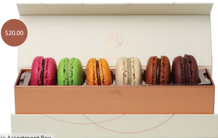
6pc Classic Assortment Box