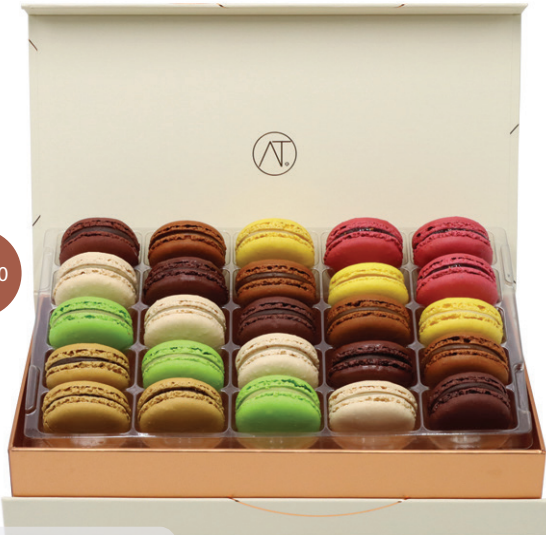
25pc Discovery Box