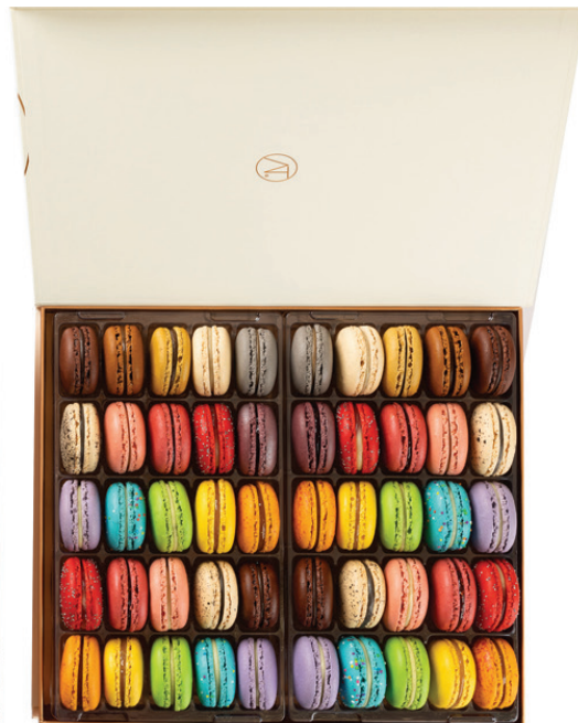
50pc Macarons Lover Holiday Box