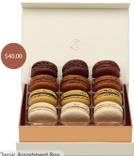
12pc Classic Assortment Box